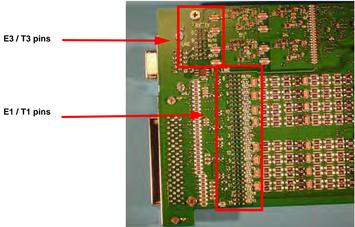
Figure 1. Combo and Combo 2 – Pin Locations and Legends

Figure 2 shows the front of a Combo or Combo 2 board, with all channels set to transmit.